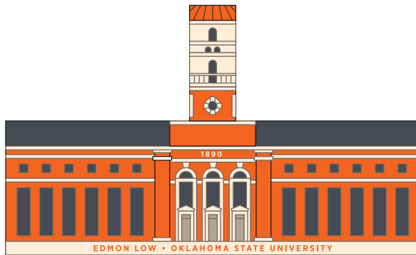
Completed front view, 6" w x 3.6" h