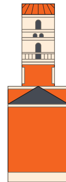
Completed side view, 1.25" w x 3.6" h

The Edmon Low library is one of the most recognizable buildings on the Oklahoma State University campus in Stillwater. Construction was completed in 1953 and the images above represent what your personal Edmon Low will look like once you finish its construction. For more history on the library, visit library.okstate.edu/about/history .