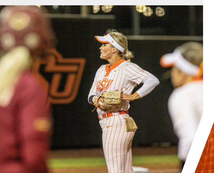
WATCH THE VIDEO: Learn more about the game day experience from OSU students at viewbook.okstate.edu